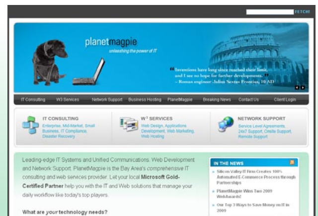
PM 3.0, the new PlanetMagpie.com

The Portfolio was a major success, too. Every entry has room for screenshots, comments from the client, a list of which development services were needed... even a 'Before' screenshot to show the changes.